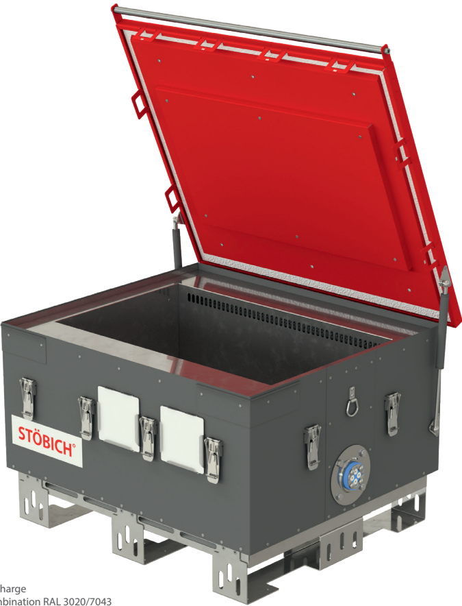
StrainBox S Charge in colour combination RAL 3020/7043

The Charge variant offers a pressure- and temperature-resistant multiple cable bushing that can be individually assigned for charging and testing purposes.